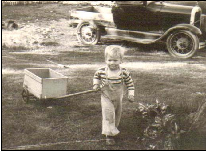
Me and my "Hershey" cart by Gramp's old "A"

I was introduced to the Model A (and other old cars) at an early age. My grandfather had a 1929 Tudor that had been converted to a tractor for use around the summer camp. I always had fun playing in it and my dad's old '36 Chevy.