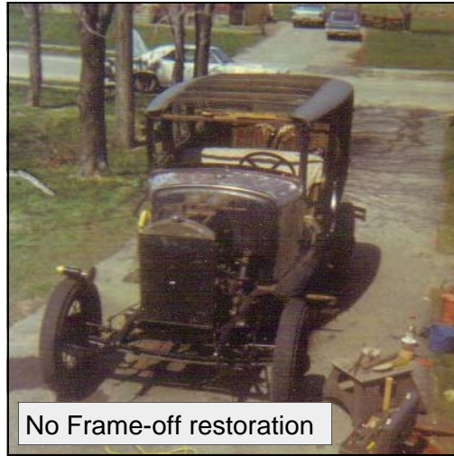
No Frame-off restoration